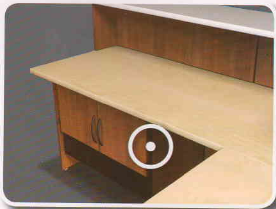
Suspended cabinet under worktop using the bracketing system.